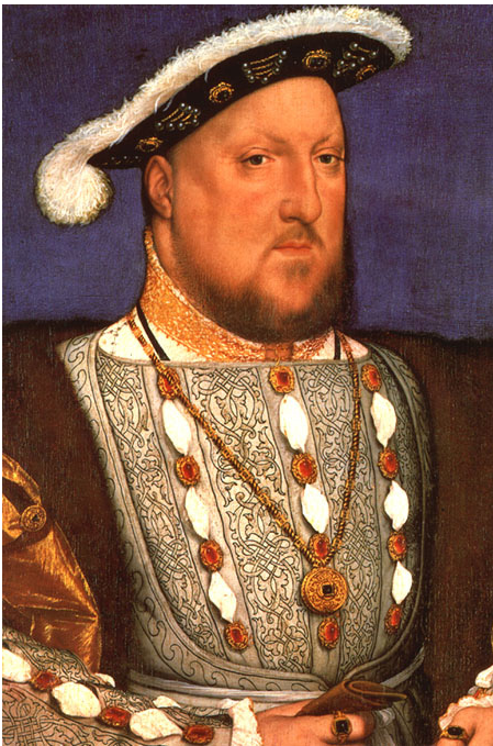
Henry VIII by Hans Holbein 1536 Thyssen-Bornemisza, Madrid