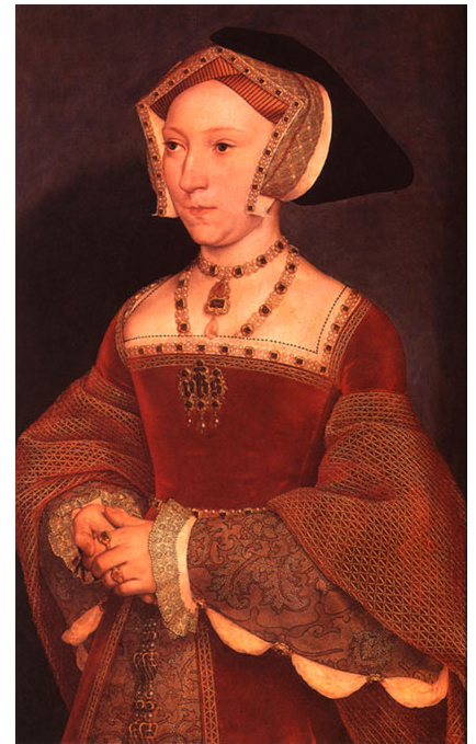
Jane Seymour by Hans Holbein, c. 1536, Vienna, Kunsthistorisches Museum