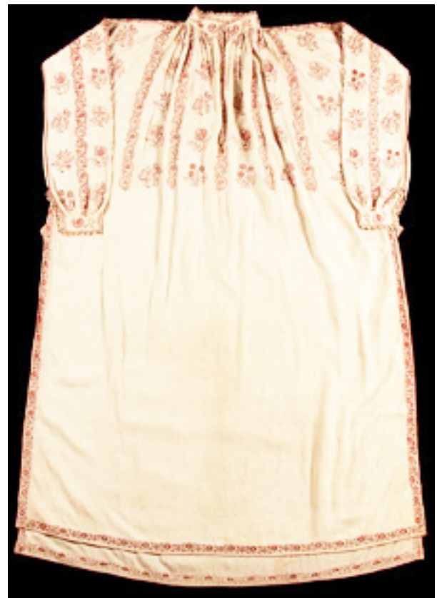
Warwick Shirt c. 1610-20, Warwick Museum, Warwickshire