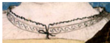
Fall Captaincy AS XL