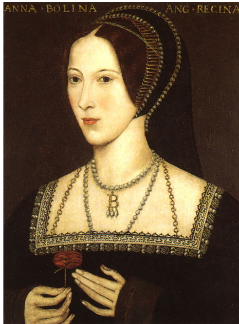
Anne Boleyn, unknown artist, Hever Castle Kent