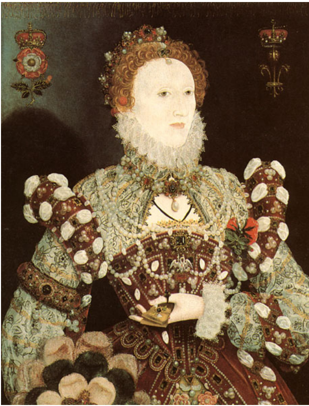
Elizabeth I - "The Pelican Portrait" attributed to Nicholas Hilliard c. 1575-80. Walker Art Gallery Liverpool (detail of sleeve and shoulder below)