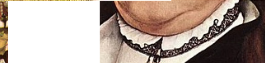
Collar from portrait of Lady Margaret Butts by Hans Holbein, c. 1543. Isabella Stewart Gardner Museum, Boston