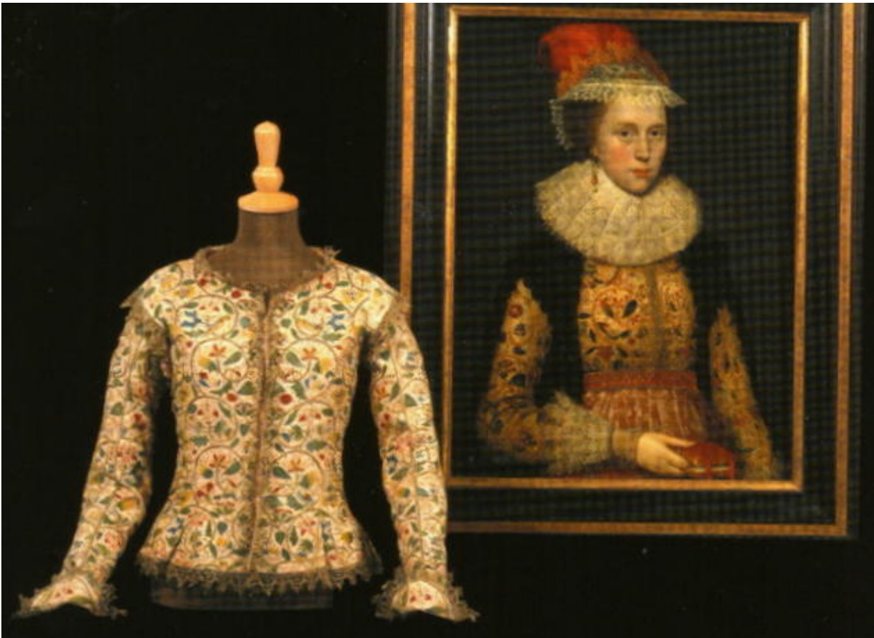
The Margaret Layton Jacket and portrait - 1610 - Victoria & Albert Museum London Right - Museum of Costume Bath - women's jacket 1620 Below - From the Embroiderer's Guild Collection EG 79-1982, Plate 12, cover, pg 28 & 38. English, Early 17th C.