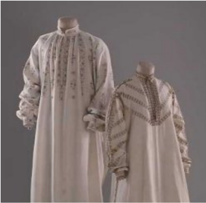
Museum of Costume Bath - Mens shirt 1580-90, Womens shift 1610

Tudor Monarchs: Henry VII 1485 - 1509 Henry VIII 1509 - 1547 Edward VI 1547 - 1553 Jane Grey July 1553 Mary I 1553 - 1558 Elizabeth I 1558 - 1603