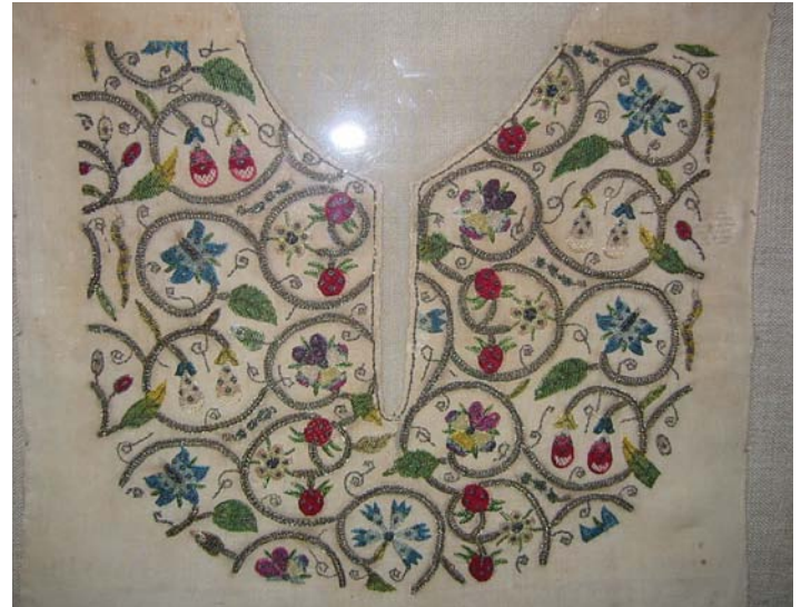
Shirtfront from the V&A - child's T. 143-1911