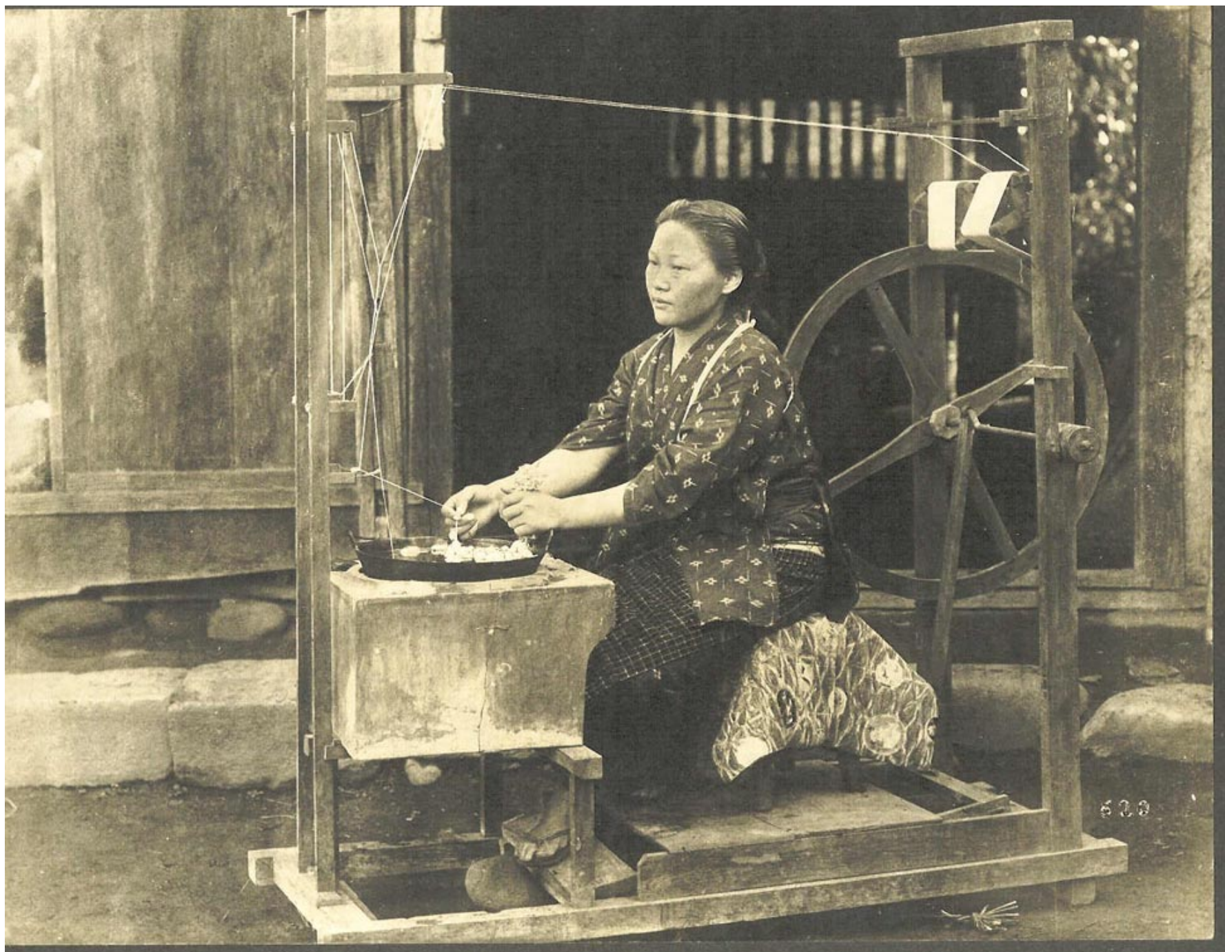
Reeling Silk, Japan around 1900 From The Philadelphia Museum Print courtesy of Linn Skinner

broidery, knitting and weaving (3/1 nm).