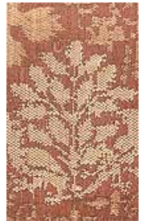
Venice or Lucca 2nd half 13th C. Abegg-Stiftung Collection

1598 – Elizabeth I presented with machine knitted silk stockings