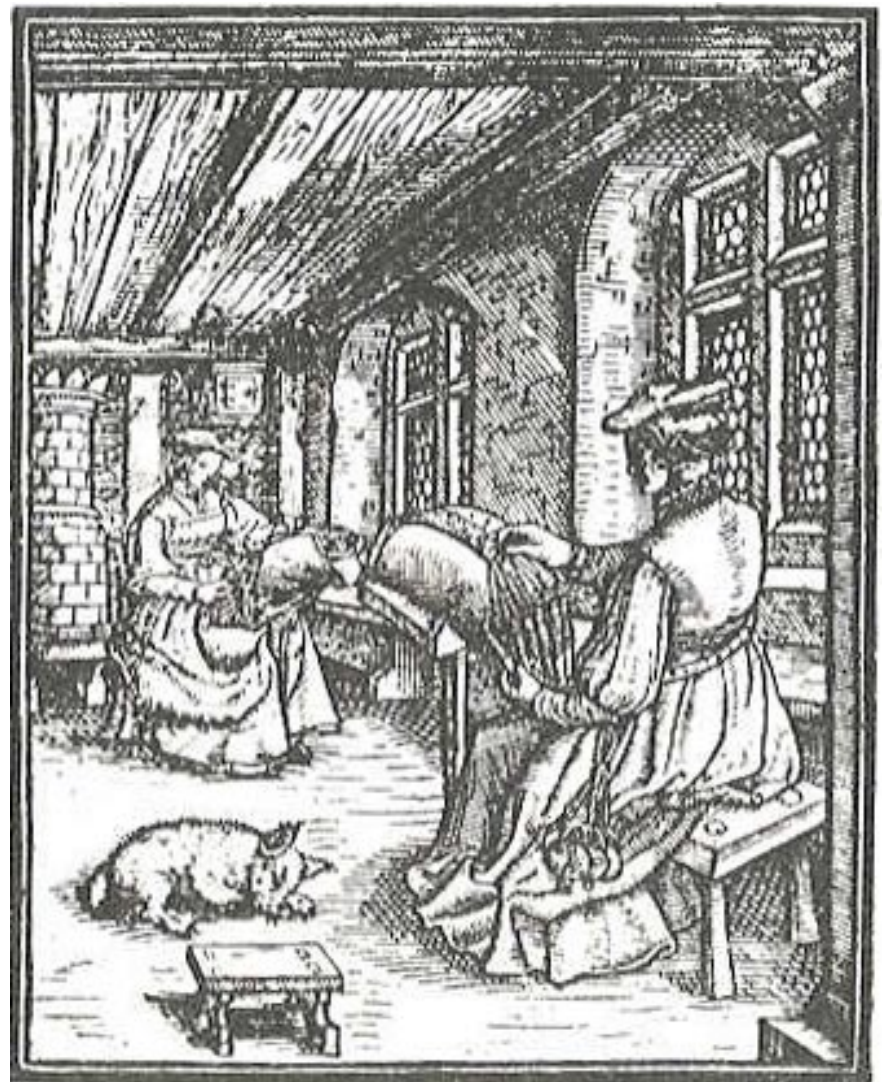
R.M. Modelbuchen 1561 Front plate showing 2 ladies doing bobbin lace

Texere – Thai Silk - A double knitting thickness, pure bleached wild silk for em-