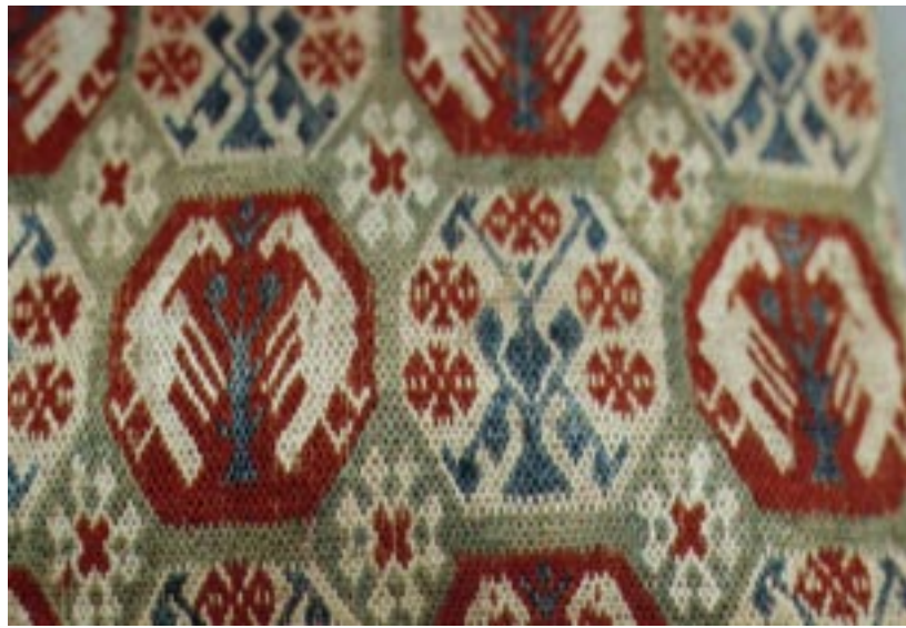
Westphalian Cushion 13-14th C. as mentioned in Schuette done in brick stitch with untwisted silk.