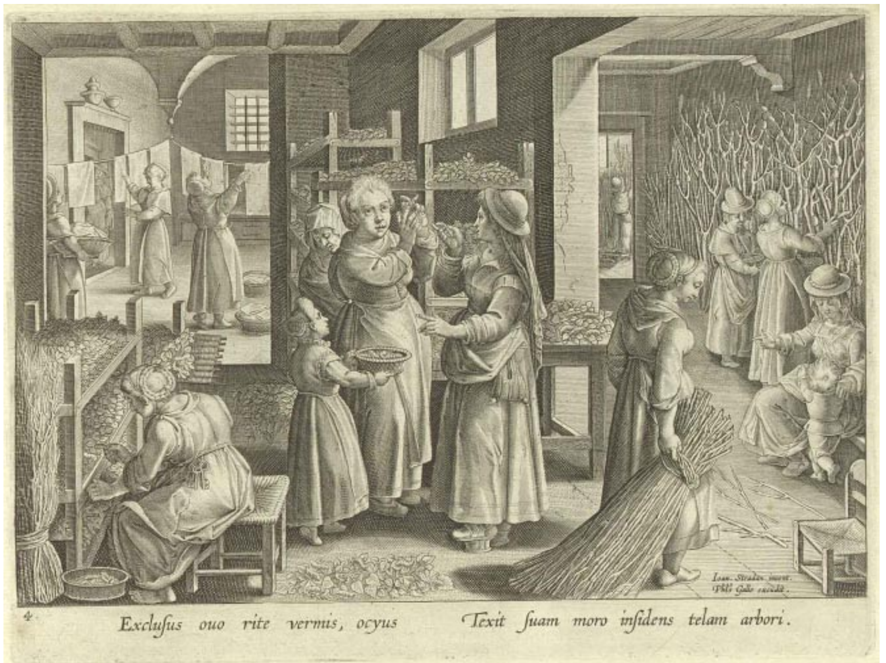
Page 4 - Vermis Sericus - instructions on the proper way to keep the worms warm and hasten its development. Some are woven onto “trees” and there remain until the sun sets.