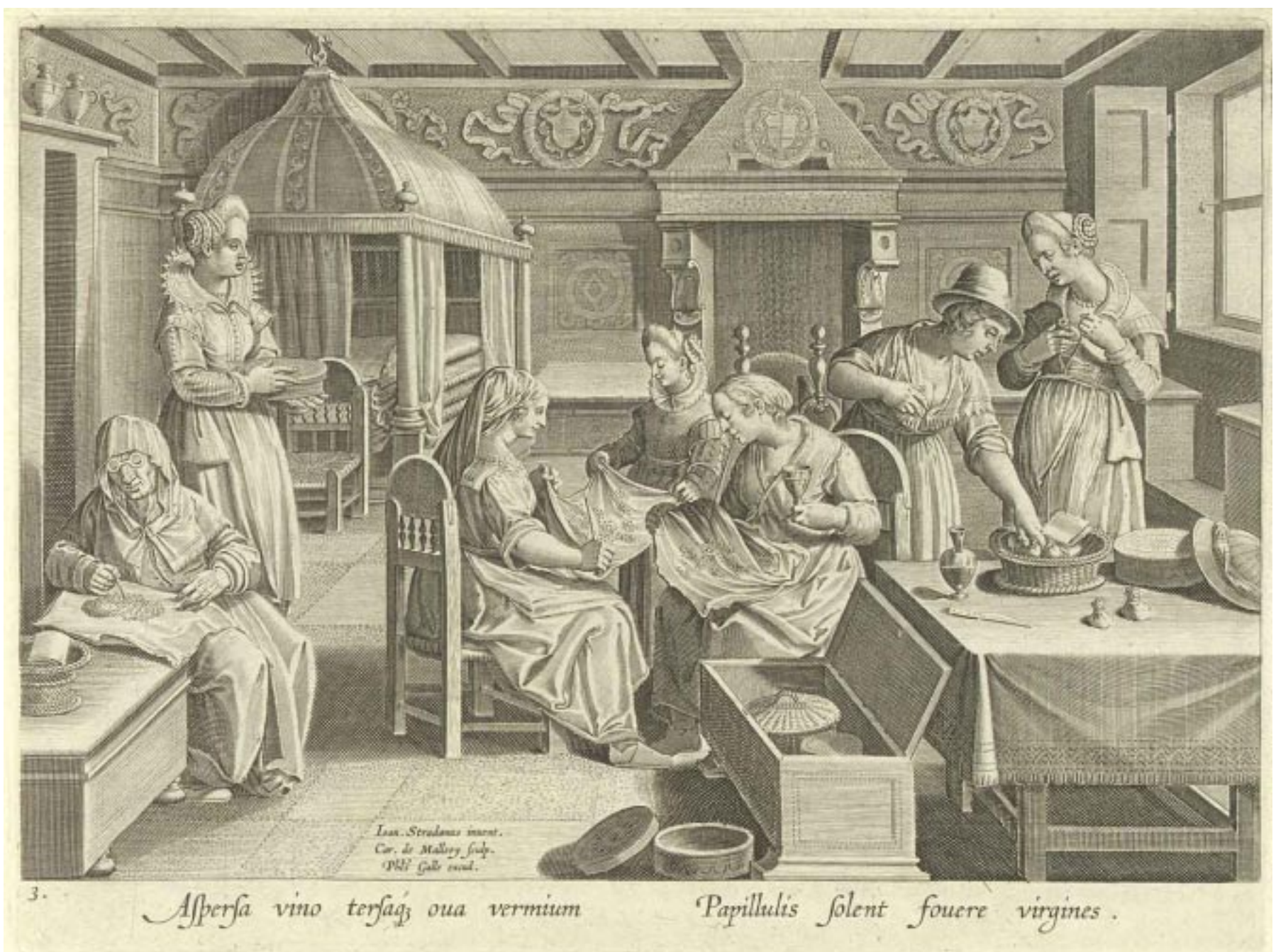
Page 3 - Vermis Sericus - young women are instructed in caring for the cocoon - keeping them clean and warm