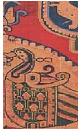
Sassanid influence on Chinese silk. 8-9th C. West China Abegg-Stiftung Collection

400-600 – silk reeling, Chinese silk techniques and the Bombyx Mori brought to India