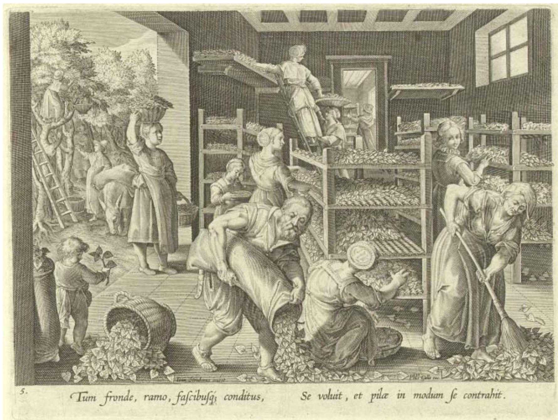
Page 5 - Vermis Sericus - the orderly progression toward the final step where the leaves are gathered and spread over the pupa.

Gloriana Threads – silk floss - spun silk that is hand over-dyed and comes 12 strand; very soft hand.