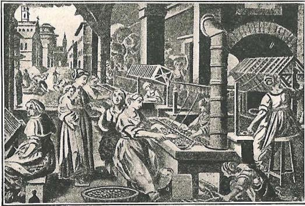
Italian Filaculture 1500 - from The Story of Silk also the last page of Vermis Sericus depicting the reeling of silk.

Gloriana Threads – Princess Perle - 3 ply twisted hand over-dyed filament silk similar to size 5 pearl.