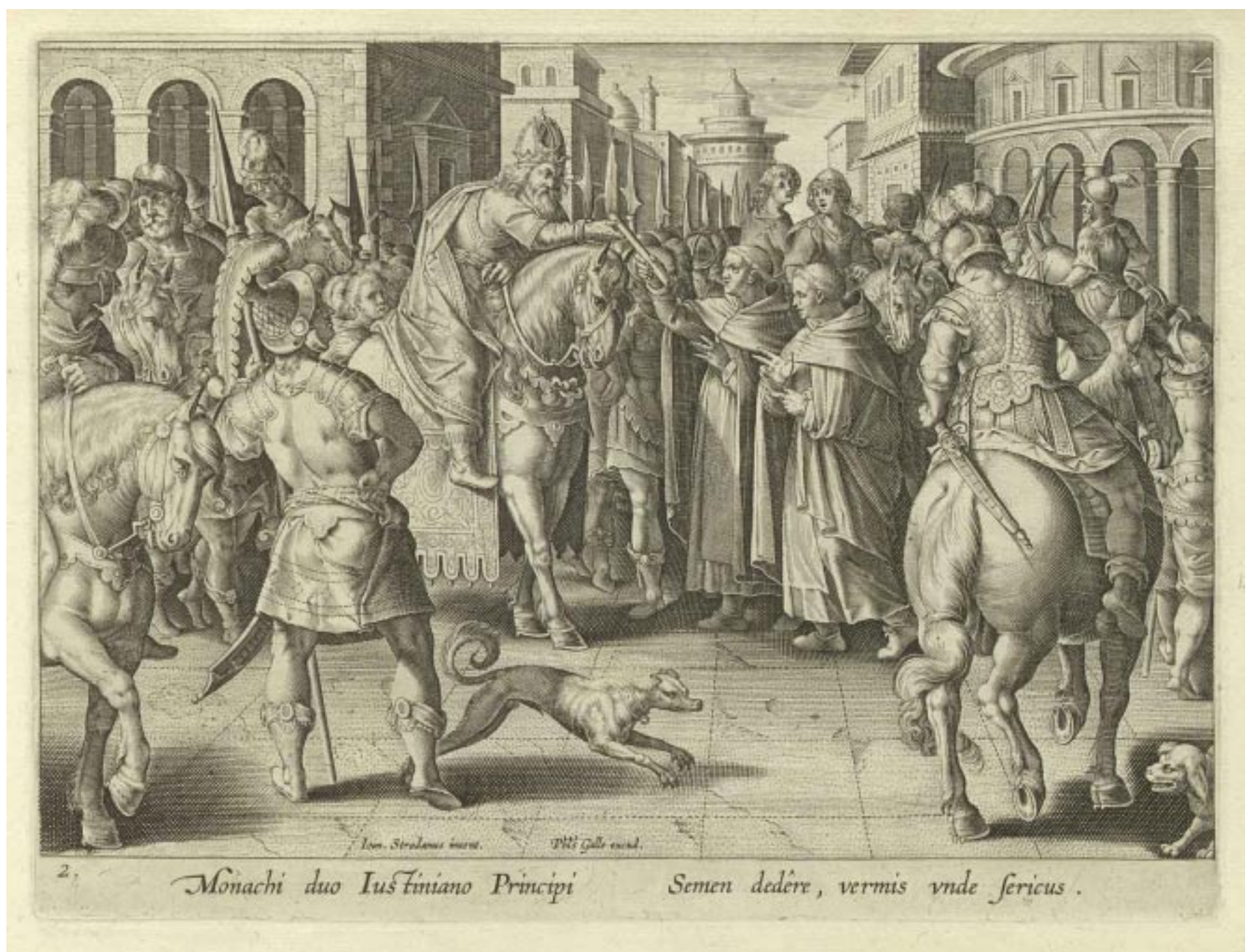
Page 2 - Vermis Sericus - the beginning where the monastic order gives the right to produce silk unto the Florentine nobles. This is whence sericulture came.

In the Alter Frontal from Middelburg, circa 1518, the gold thread embroidery is laid two by two and couched in silk. In both the Or Nue technique and the laid and couched silk sections, the silk used has no twist. The metal threads have an S-