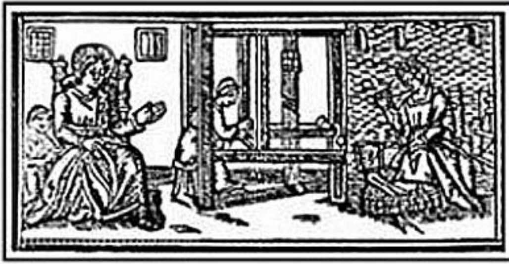
Medieval Woodcut of women producing cloth