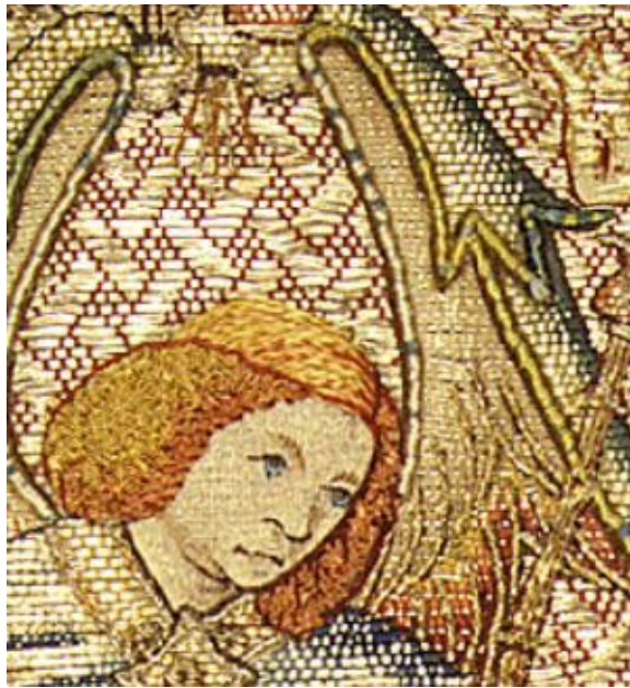
Above - Example of patterned couching. Embroidery with the Annunciation Mid-15th C. Netherlands Metropolitan Museum of Art 1990.330